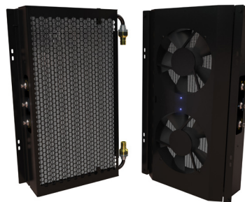
AHX (Active Heat Extractor)

From the RDN, the liquid R134a flows through flexible stainless-steel hoses that connect to active heat extractors (AHX) which are mounted in the rear doors of