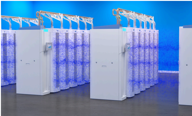
OptiCool Laminar Airflow – The Next Generation In Data Center Cooling.

The AHX fans pull the hot air from the servers through the AHX units. The heat is absorbed into